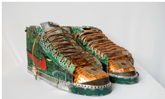
'Circuit Board Sneakers' gabrieldishaw.com

The 19 th Electronics New Zealand Conference 10-12 December 2012 University of Otago Dunedin